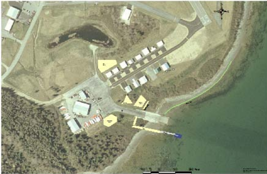
Aerial Photograph of Trenton Facility with activities areas indicated