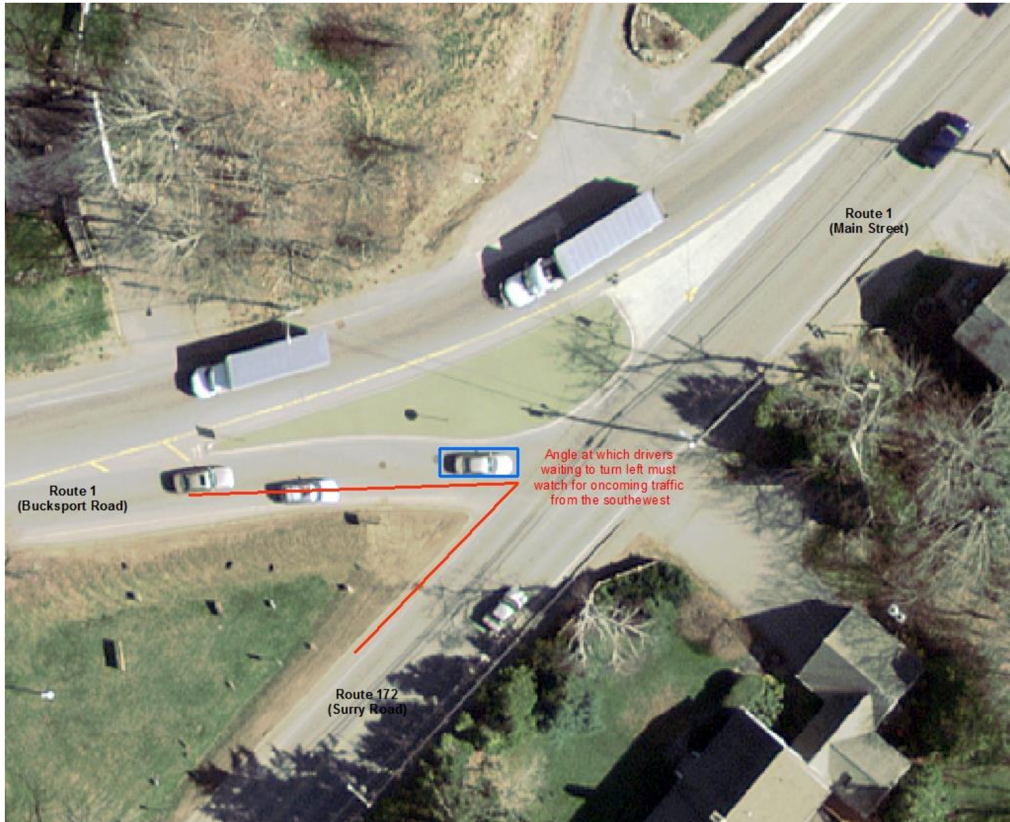
Photo A. Traffic traveling through on Route 1 from the west to the northeast arrives at this intersection at an awkward angle.